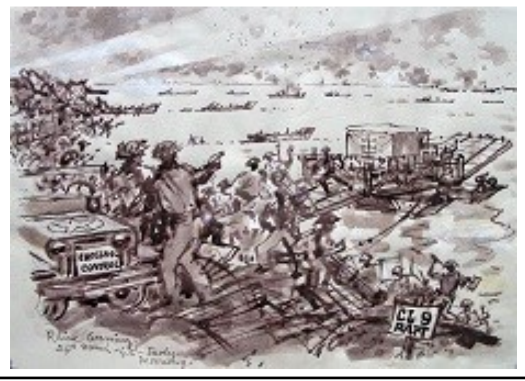
An original sketch, 24th March 1945, by Private E Earnshaw [Int section] entitled "Crossing the Rhine, early morning". [After the war he became an illustrator for the soldier magazine]

By H-Hour all communications were working smoothly and all routes leading to the river were lit by lamps, shaded from the enemy, and set down at every 100 yards. Above the sound of the gun-fire began the characteristic clatter of the tracks and the roar of the engines of the first wave of 'buffaloes' – the amphibious vehicles—passed, in line ahead, on their way to the river. As they approached the bank they checked momentarily, and then in a perfect drill movement fanned into line abreast, and again moved forward. At 02:00 precisely the first wave, containing the assault companies of the 15<sup>th</sup> Division and parties of 'A' and 'B' companies of the battalion, dipped into the Rhine and became waterborne.