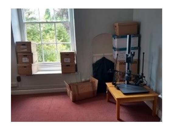
New room for Reserve Collection and Photography room, still to be completely reorganised. Used to be the Regimental Secretary Office and later the Director of AMOT office.