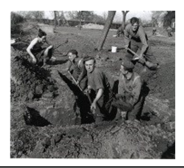
Men of the 5th Battalion, seen here digging in on the Home Bank side of the River Rhine . They earned for the Regiment the battle honour 'Rhine Crossing'

The others, who would operate of the far bank, remained hidden in areas where they would embark in amphibious motor vehicles when the time came. From the start all positions were under spasmodic artillery, mortar and machine-gun fire. Everyone dug in quickly to escape attention. A smoke screen forming part of the deception plan- cloaked the entire front from dawn to dusk, blinding the German artillery, and undoubtedly saving casualties