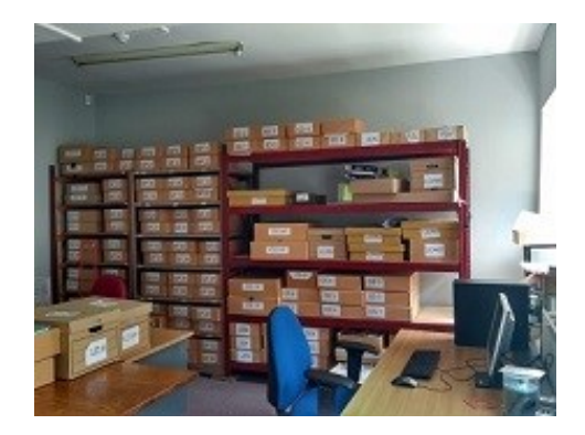
The new Archive room, now located in what used to be the Registry Office of the Regimental Headquarters.