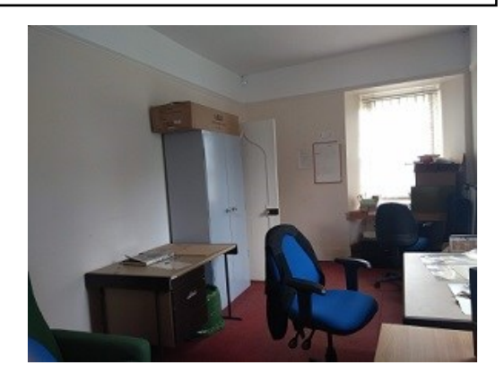
Former Archives Room now the Volunteers Transcribing/Rest Room