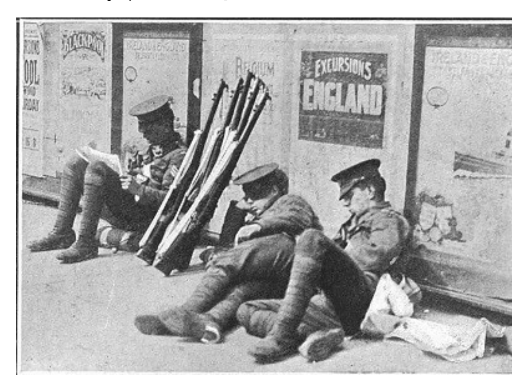
Soldiers resting on Belfast Quays Editor's note: Same accommodation standard as Londonderry August 1969

[Other soldiers injured Private Chapman - Concussion. Private Fisher - Serious injury to leg. Private Carter - Injury to forehead.]