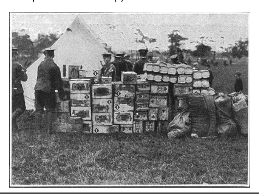
The Battalions 80.000 rounds of ammunition stacked in their tented area in the Ormeau Park, Belfast.

Police resources were stretched and the city was increasingly unsafe for them. In late July, hundreds of police mutinied and joined with 10,000 strike supporters in an atmosphere of euphoria. Unable to rely on the police, the authorities sent in thousands of troops and serious rioting ensued. Meanwhile, leaders of the police strike were dismissed and over 200 constables were transferred out of Belfast. On the night of 11th August, soldiers killed a Catholic woman and man on the Falls Road. On both side of the sectarian divide, opportunistic politicians linked the dispute to the cause of Irish Nationalism. Meanwhile, the British trade union leadership, alarmed by the rising militancy, travelled to Belfast and negotiated settlements to several disputes while Larkin was attending his mother's funeral in Liverpool. The dockers were isolated and the strike ended in bitter defeat. In the following years, thousands of Catholics and progressive Protestants were expelled from the shipyards.